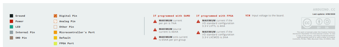
Figure 2. MKR Vidor FPGA pinout

Pinout Table: Pin Function T11 SP1_V_D1 R10 ADC_2 P11/VREFB0H ADC_3 R11 ADC_4 N6 LPO_1H P6/VREFB0H N5 RW11_TKEN/SP1_V_HD blue RW11_RXD0/DAC_16 green RW11_RXD1/DAC_17 T5 RW11_CS0DV R1 RESET_N R5 UART_RTS/RW11_TXD1/SP1_V_WP R6 UART_CTS/RW11_TXD0/SP1_V_D0 E15/DIFFCLK_2P TXD T6 UART_RXD RW11_R0I0 RW11_R0CLK N9 RW11_CLK/SYS_BOOT N11/R0N2 SP1_V_CS T10 SP1_V_CLK T4/PLL1_CLKOUTN JTAG_TMS J13 JTAG_TDO N6 ADC_34 R4/PLL1_CLKOUTP JTAG_CLK N1 JTAG_TDI Legend: Red: LED_BUILTIN pin Blue: Interrupt JTAG output Green: FPGA tag clock Yellow: E26301Q1 (power source)